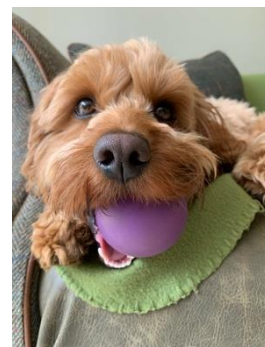
Bella – our school dog